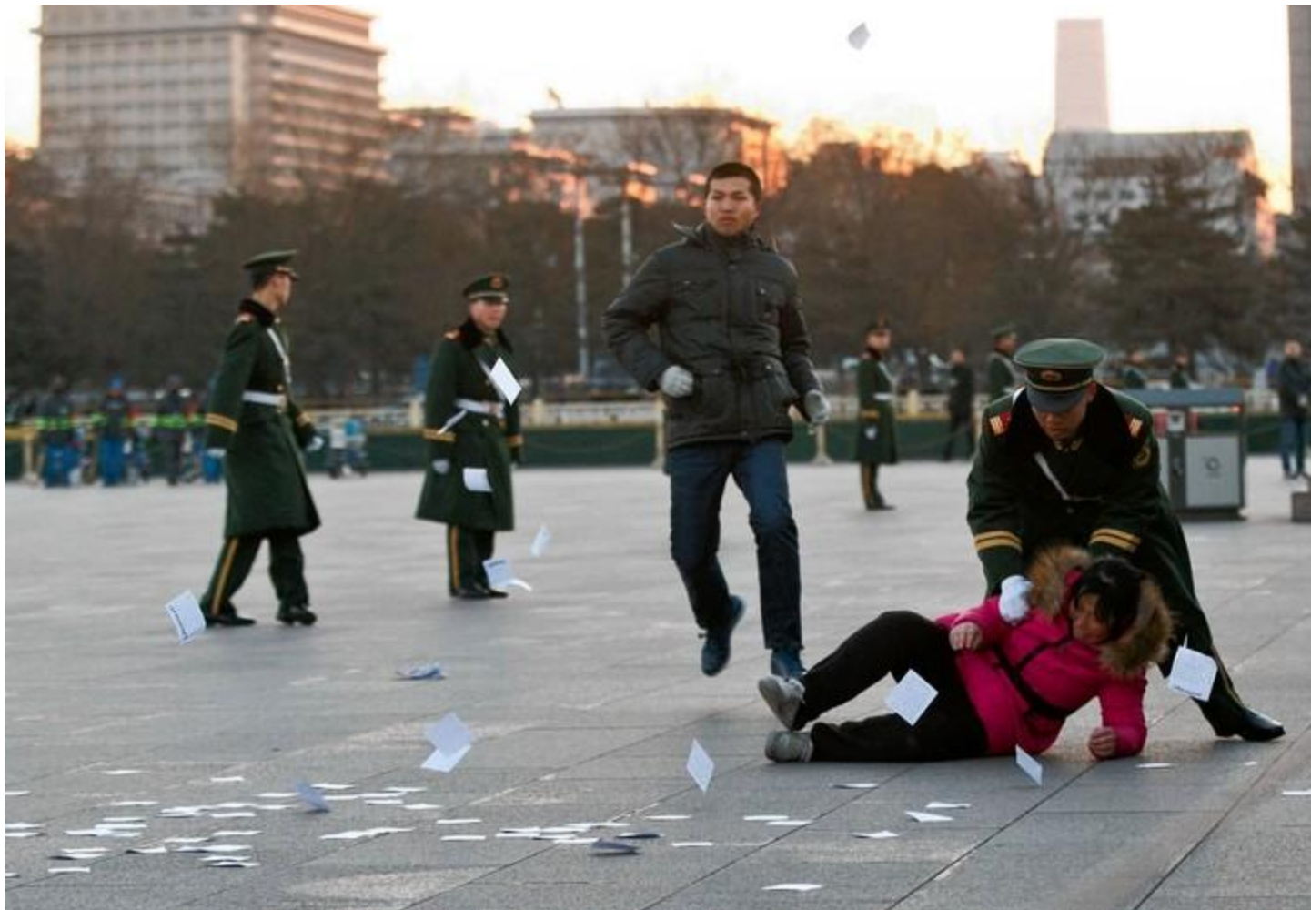
A protester is pushed to the ground by a paramilitary policeman March 5, 2014, in Beijing before the opening of the National People's Congress nearby.

Third, even many regime loyalists are just going through the motions. It is hard to miss the theater of false pretense that has permeated the Chinese body politic for the past few years. Last summer, I was one of a handful of foreigners (and the only American) who attended a conference about the “China Dream,” Mr. Xi’s signature concept, at a party-affiliated think tank in Beijing. We sat through two days of mind-numbing, nonstop presentations by two dozen party scholars—but their faces were frozen, their body language was wooden, and their boredom was palpable. They feigned compliance with the party and their leader’s latest mantra . But it was evident that the propaganda had lost its power, and the emperor had no clothes.