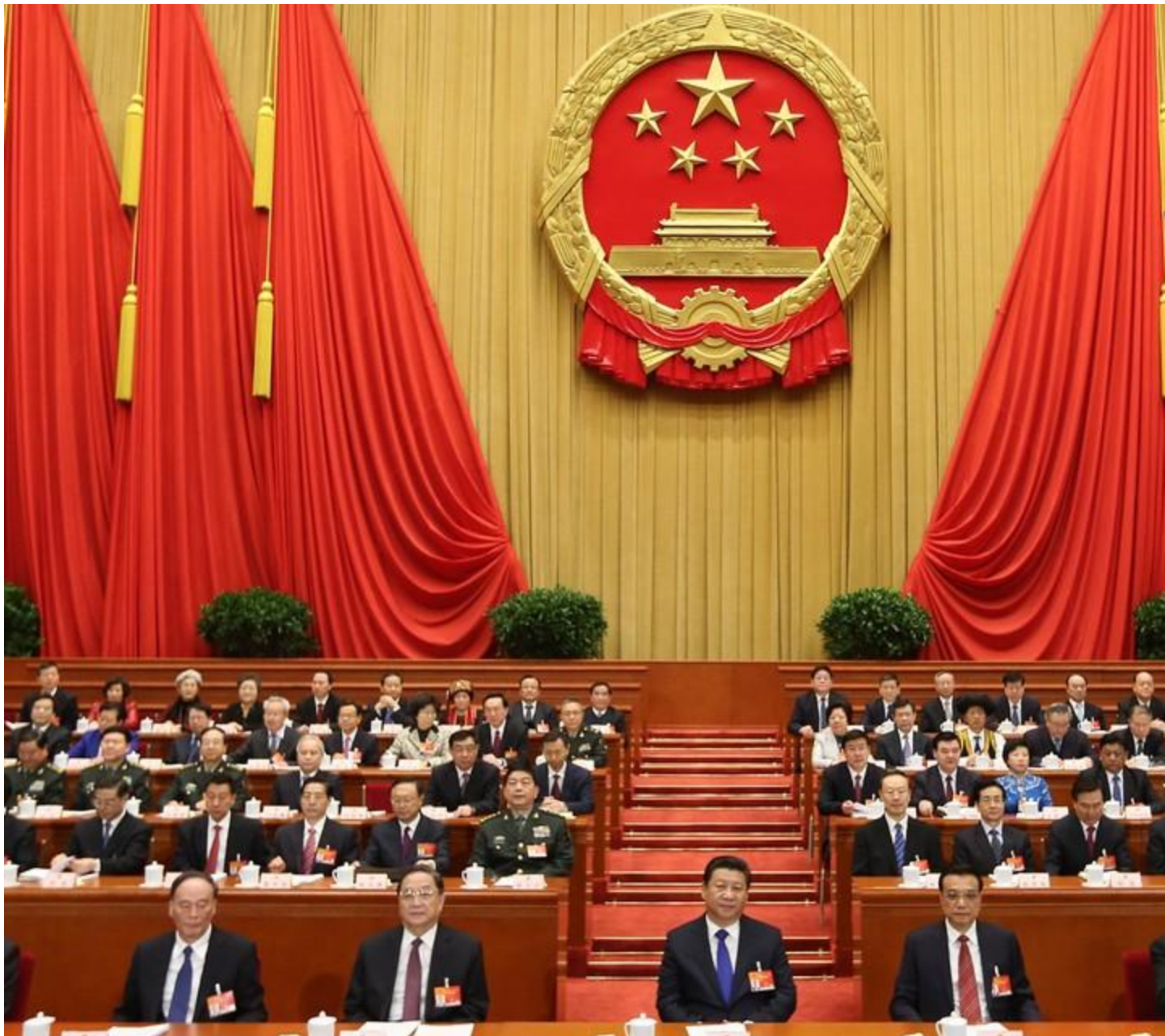
Chinese President Xi Jinping, front center, and other Chinese leaders attend the opening meeting on Thursday of the third session of the National People's Congress at the Great Hall of the People in Beijing.